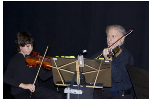
Members of the NJ Intergenerational Orchestra