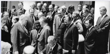
President Johnson signing the OAA in 1965