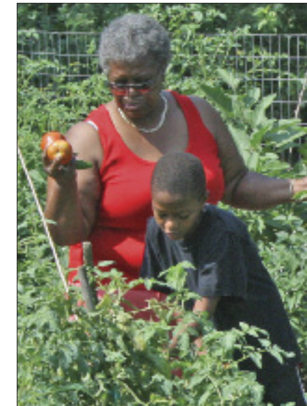
A Camden City Garden Club participant and her grandson check out their bumper crop of vegetables.

Recognizing the impact of the nation’s economic downturn, the NJFA has focused its grantmaking on programs that provide emergency services such as food, shelter, and transportation and health services.