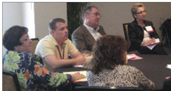
Participants enjoying one of the 2010 Breakout sessions.