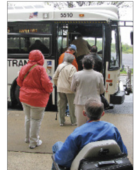
Greater Mercer TMA participants in Hamilton and Lawrenceville get on board for their field trips.

Greater Mercer TMA provides travel training, helping seniors develop a level of ease to utilize